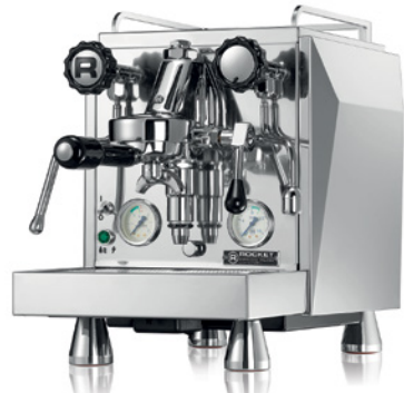
GIOTTO TYPE v