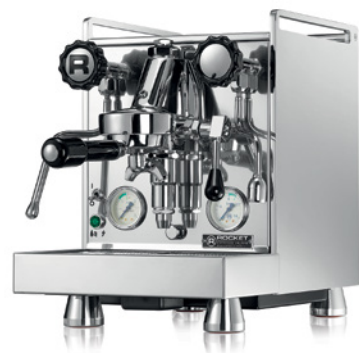
MOZZAFIATO TYPE v